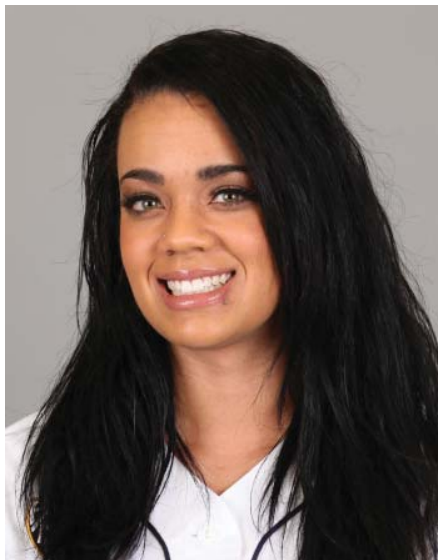
Wallace Game Highs